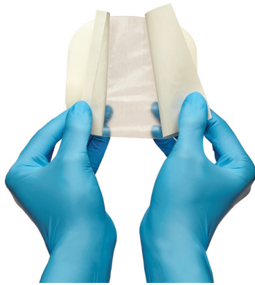
TASA™ Thin Absorbent Skin Adhesive™ Dressing